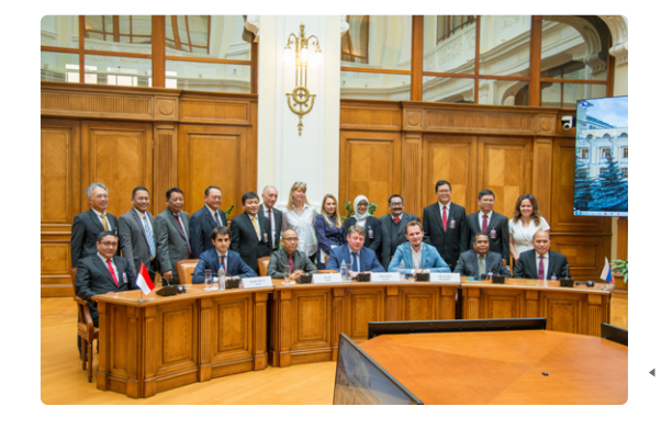
Indonesian Bankers' Delegation Visits Russia, Moscow

In order to strengthen the international ties of its member banks, the Association actively engages in bilateral cooperation with foreign banking unions, credit institutions, and international financial organizations. The Association also participates in dedicated sub-groups and sessions hosted by the Bank of Russia, federal ministries and other government agencies.